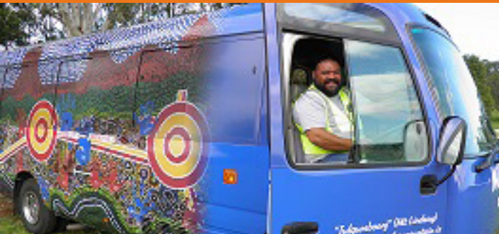
Bonalbo Fleet Vehicle